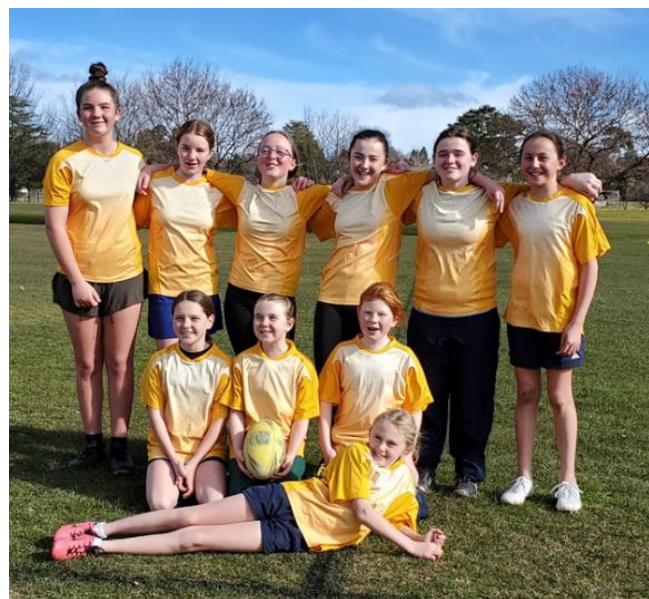
OSSA Gold Girls Touch Team

On the way back to school the bus took an unexpected detour to Maccas to reward the girls for their effort and positive attitude. Well done OSSA Gold!! (Mr Inman)