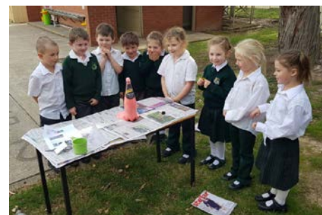
Kinder Science lesson

K-1 students in Literacy have been working on the book Elmer by David McKee. The message of the book being – it's ok to be different and still belong. The students have been producing some pleasing writing during their literacy sessions and are being encouraged to think about vocabulary that they choose when writing. Well done everyone.