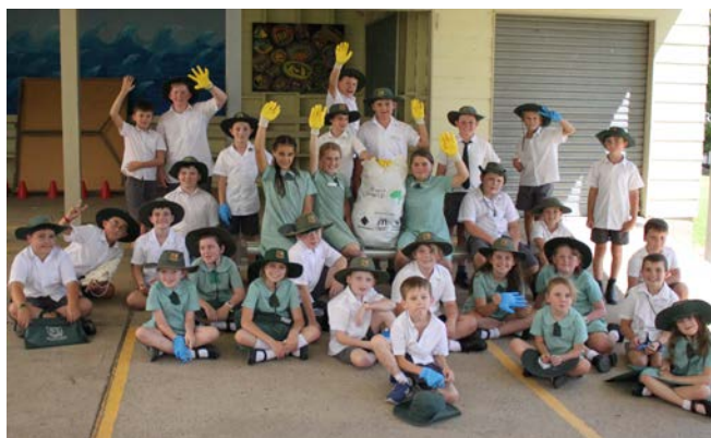
Students taking part in Clean up Australia Day

This week staff will attend PL on Wednesday afternoon with other OSSA staff where they will gain insight into new support structures and personnel, from Orange District Office, who can assist in with new teaching and learning programs.