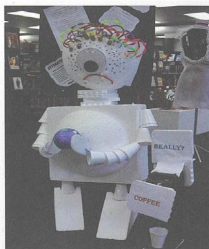
Artist: Mullion Creek Public School - Yrs 4-6 Title of work: "Dying For a Coffee" Category: Primary 3 Dimensional

At Mullion Creek Public School we decided to make a difference, not only for our school but for our Earth. We no longer use Styrofoam and are disappointed when it is used for insulation and packaging. Our Earth is being destroyed by this disgusting material and its time you put a stop to it too.